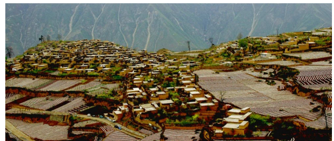
Figure 1. Luobo village in Li County, Sichuan Province.

Interviews with villagers showed that the villagers in ethnic settlements in the upper reaches of the Minjiang River have strong blood ties and in-laws, the relationship of in-laws in the three generations reached more than 50%, and the relationship of in-laws within the five generations reached more than 80%. In particular, the spatial boundaries of family spaces within Qiang ethnic settlements are vague and their functional layouts are highly similar. (Figure 1) The external appearances of buildings are uniformed, and the interior structures of settlements are interconnected. The integral walls of different family buildings and the integrity of the entire settlement space Strong, become the largest ethnic Qiang ethnic settlement and highlights.