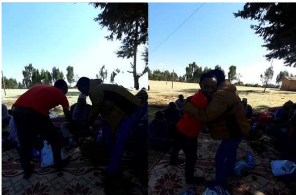
Figure 5. Ending Reconciliation by jarsummaa institution among conflicting parties.