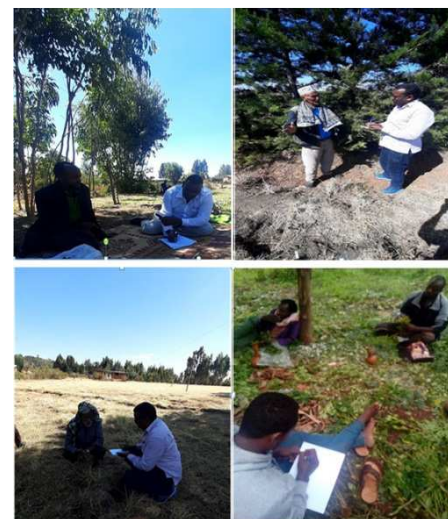
Figure 3. Picture during some sampled household interview.