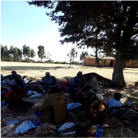
Figure 4. Picture of during Start reconciliation through jarsumma institution by jaarsafayisoo.