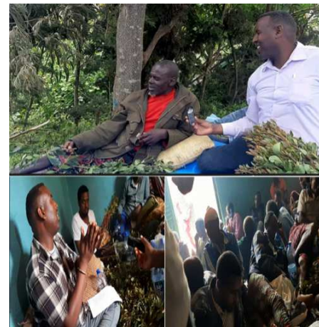
Figure 2. Picture taken during an interview with the key informant and focus group discussion.